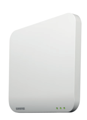
MXWAPT Access Point Transceiver